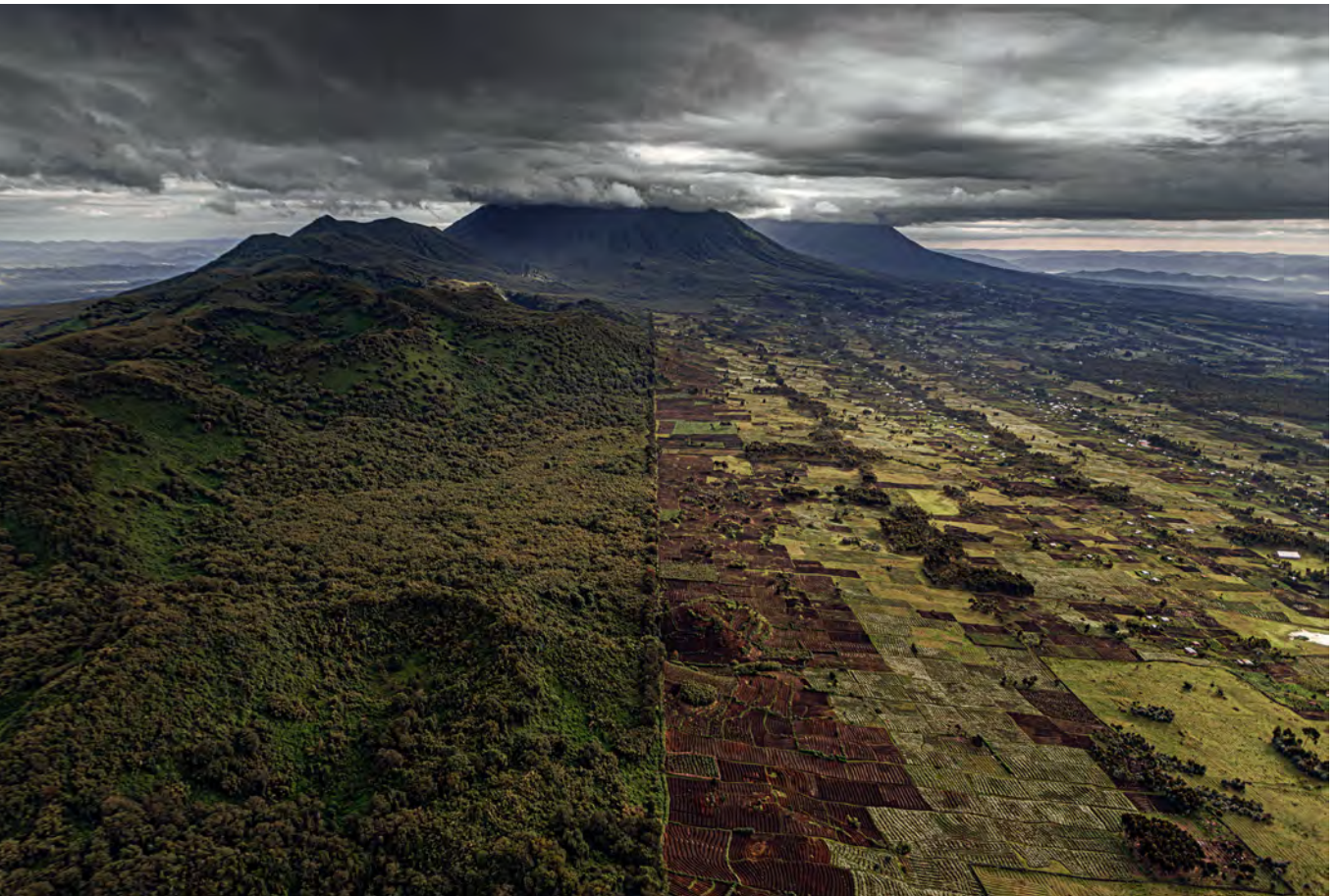
Photo: Habitat destruction leads to disease emergence, but the underlying mechanisms, the prediction and the prevention of possible outbreaks are still poorly understood. Knowing and cataloging pathogens that affect ape species may benefit human medicine while supporting conservation efforts. Habitat conversion along the edge of Volcanoes National Park.

Moreover, the governance of tourist sites that offer visits to wild, habituated ape populations would benefit from the joint input of professionals, including conservationists, ecologists, ape managers, travel medicine specialists and social scientists (Muehlenbein and Ancrenaz, 2009; Munanura, Backman and Sabuhoro, 2013; Russon and Wallis, 2014a). The first step could be to conduct an in-depth assessment of ape visitation sites, including through a cost-benefit analysis of current ape tourism projects and analysis of their contributions to ape conservation. The assessment could give rise to recommendations for improving governance and decision-making processes that guide ape habituation and ape-related tourism.