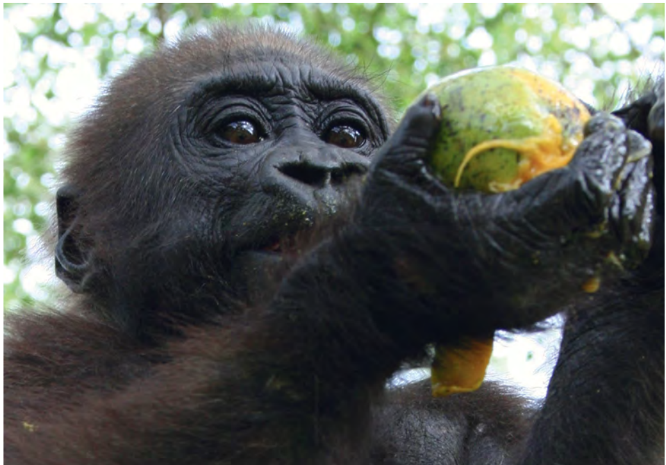
Photo: Apes held as pets by private owners are generally at greater risk of contracting and transmitting infectious diseases, as they live in closer proximity to humans. Illegally kept apes often suffer from various degrees of malnutrition and malabsorption. Juvenile gorilla at a hotel in Gabon. He was later sent to a sanctuary.

Long-term visitors include researchers, documentary film crews, rangers and park personnel, local community members, carers and volunteers for captive and semi-captive