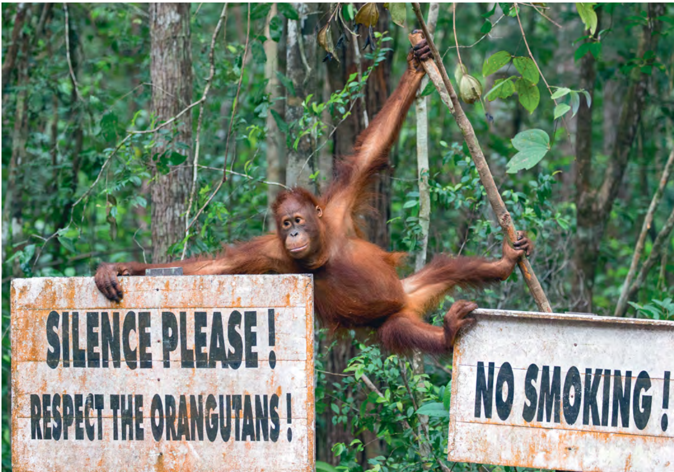
Photo: In rehabilitation sites such as Indonesia's Tanjung Puting in Kalimantan and Malaysian Borneo's Sepilok in Sabah, former rehabilitants not only stopped their usual foraging activities during tourist visitation and food provisioning, but also increased their vigilance and self-directed behaviors. Tanjung Puting National Park, Borneo, Indonesia. © Suzi Eszterhas / naturepl.com

susceptibility to diseases (Sapolsky et al. , 1990; Shutt et al. , 2014; Wasser, Sewall and Soules, 1993; Woodford, Butynski and Karesh, 2002). Studies undertaken during ape habituation processes have documented clinical signs of infectious diseases in chimpanzees, as well as higher parasitic loads in mountain gorillas, although the latter could be related to them living in close proximity to humans, near the park boundary (Fujita, 2011; Morton et al. , 2013). In contrast, analysis of fecal and hair cortisol concentrations shows that wild chimpanzees habituated to ecotourism are not chronically stressed, unlike orangutans and western lowland gorillas (Carlitz et al. , 2016; Muehlenbein et al. , 2012; Shutt et al. , 2014).