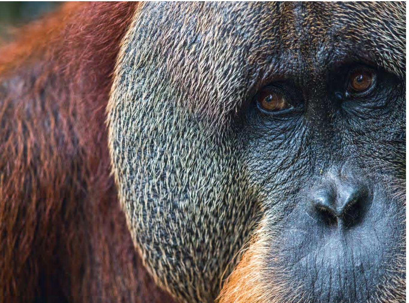
Photo: Apes—humans' closest living relatives—are intelligent, sentient beings with complex social lives. As such, they attract local and international scientists, students, tourists, filmmakers and other visitors in the wild and in captivity. © Paul Hilton/Earth Tree Images

captive (and semi-captive) apes. The aim of a habituation process is to decrease the flight distance of apes when they encounter humans. The removal of apes' fear and need to flee effectively reduces any significant anthropogenic effect on their natural behavior, although some degree of human influence on their behavior is inevitable (Tutin and Fernandez, 1991; Williamson and Feistner, 2011). Moreover, habituation directly heightens the risks of disease spillover to apes, as they tolerate closer proximity to people (Köster et al. , 2022; Russon and Wallis, 2014a). One way of minimizing these risks is to ensure that habituation and