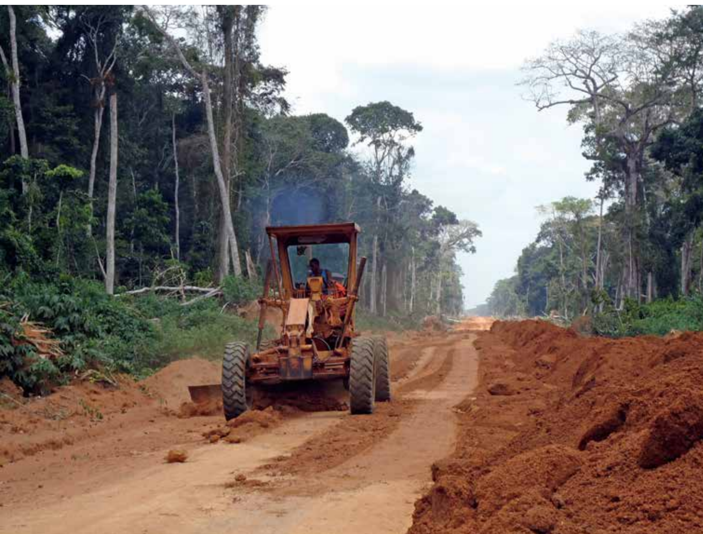
Together with industrial agriculture, linear infrastructure projects, including roads, are the leading cause of ape habitat loss and fragmentation. Road construction in Guinea.

In sub-Saharan Africa, a network of 35 “development corridors” are planned in order to connect cities, ports, airports, mines and hydropower plants. In total, 53,000 km of roads, railways and power transmission lines are envisioned (Laurance et al. , 2015b; Weng et al. , 2013). It is anticipated that 23 of the corridors will bisect protected areas with 3,600 km of linear infrastructure, and that one-third of Africa's total