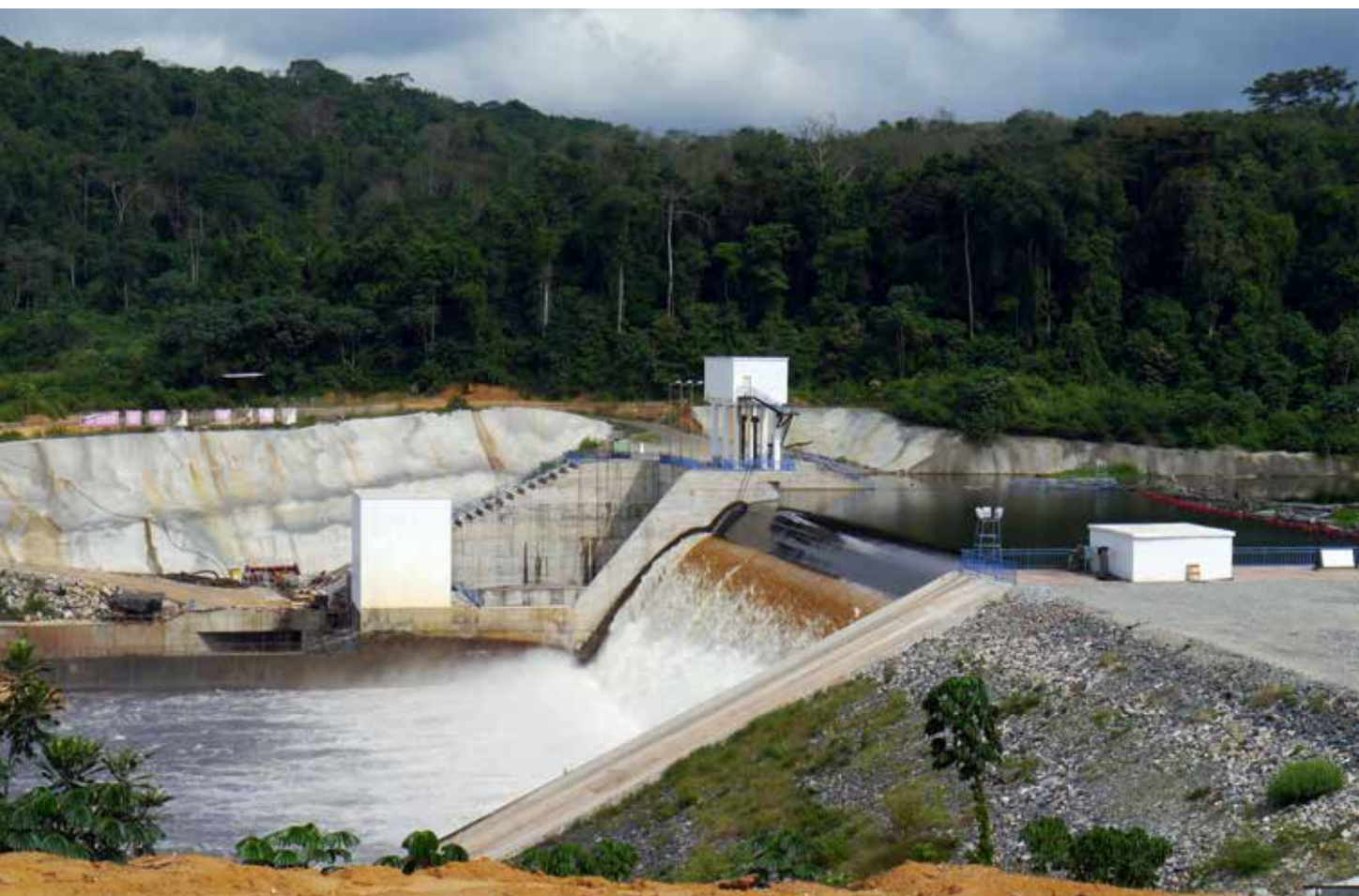
Deforested areas and hydroelectric dam reservoirs create barriers to ape movement and reduce their access to food, shelter, water and other gene pools. Grand Poubara dam, Gabon.

shown to decline in proximity to roads and settlements due to the associated hunting pressure that results from increased human access to ape habitats (Fa, Ryan, and Bell, 2005; Kuehl et al. , 2009; Laporte et al. , 2007; Marshall et al. , 2009; Poulsen et al. , 2009; Poulsen, Clark and Bolker, 2011); Wilkie et al. , 2001). Other linear infrastructure can have similar effects, as demonstrated by the Chad-Cameroon oil pipeline, which facilitated forest access for poachers and illegal loggers. Power transmission lines linked to hydroelectric dams can also fragment ape habitat (Andrews, 1990; White and Fa, 2014). Additionally, when constructing dams and filling their reservoirs, habitat is destroyed and natural river processes are halted (O'Connor, Duda and Grant, 2015).