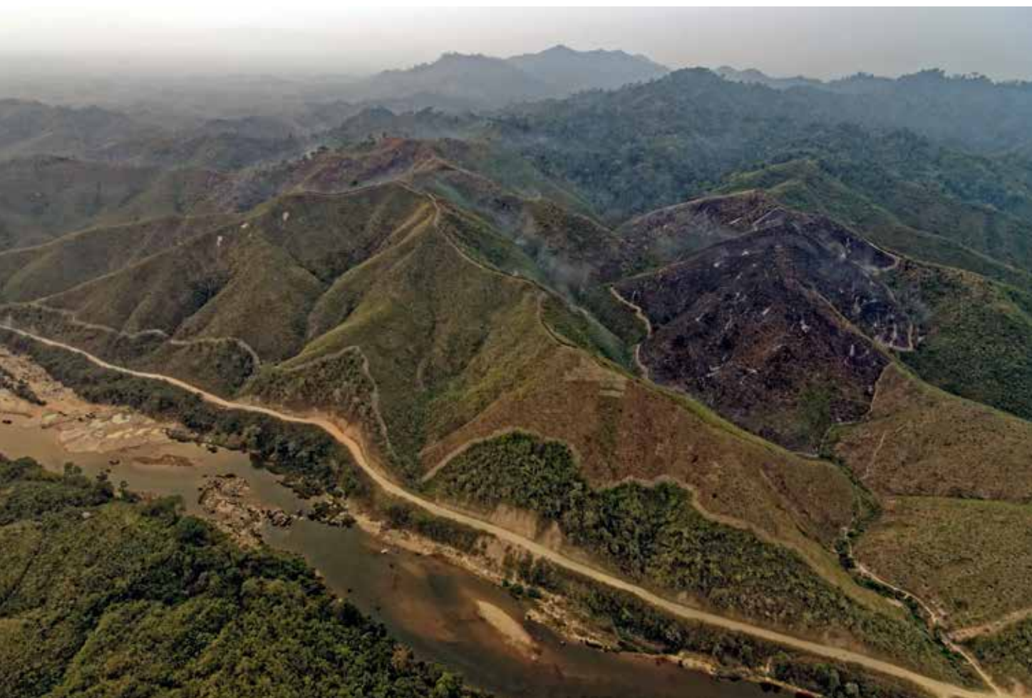
Deforestation along the access road for the Dawei road link, east of Myitta, Myanmar.

et al. , 2008; Maisels et al. , 2013; Stokes et al. , 2010; WCS, 2015). Routes cleared for the construction of roads, pipelines and transmission lines provide forest access for hunters to kill wildlife with guns and bows and to set and check snares. Entry by vehicle allows hunters to kill or capture a higher volume of wildlife, and then to make a speedy and inconspicuous escape (Fimbel, Grajal, and Robinson, 2001). For instance, one Republic of Congo logging concession saw 3,000 km of tree inventory transects established in a single year. These transects reduced travel time through the area from four days to one (Wilkie et al. , 2001).