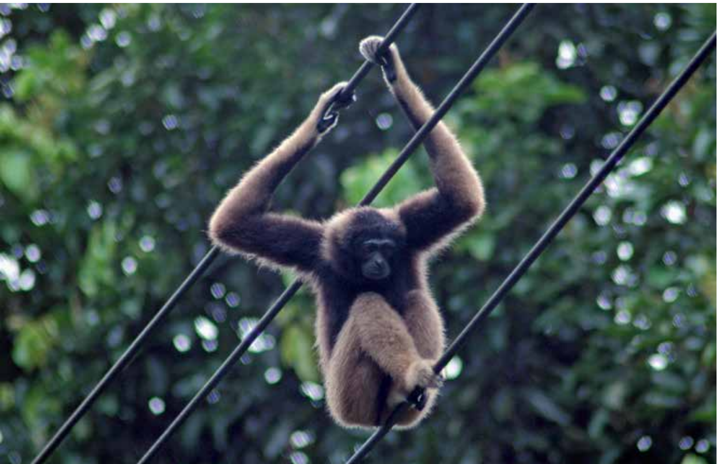
Gibbons rarely come to the ground, so the construction of roads, and other infrastructure, dissects their habitat and results in intense fragmentation. Wildlife bridges allow animals to cross artificial barriers.

Apes must be in good health for successful reproduction and their reproductive rates are slow. Births are widely spaced, occurring on average every 4–7 years in African apes, every 6–8 years in Bornean orangutans and every 9 years in Sumatran orangutans. A mother usually gives birth to a single offspring, and remains heavily invested in the infant's development until it matures. This makes it very difficult for a population to recover from losses, if it ever does (IUCN, 2014a). Given their genetic similarities to humans, apes are susceptible to human diseases, and they can also contract pathogens from domestic livestock or unsanitary conditions in settlements. Coming into more frequent contact with people and human-altered landscapes increases apes' vulnerability. Humans, too, are placed at risk of contracting diseases from apes and other wildlife upon entering remote forest areas.