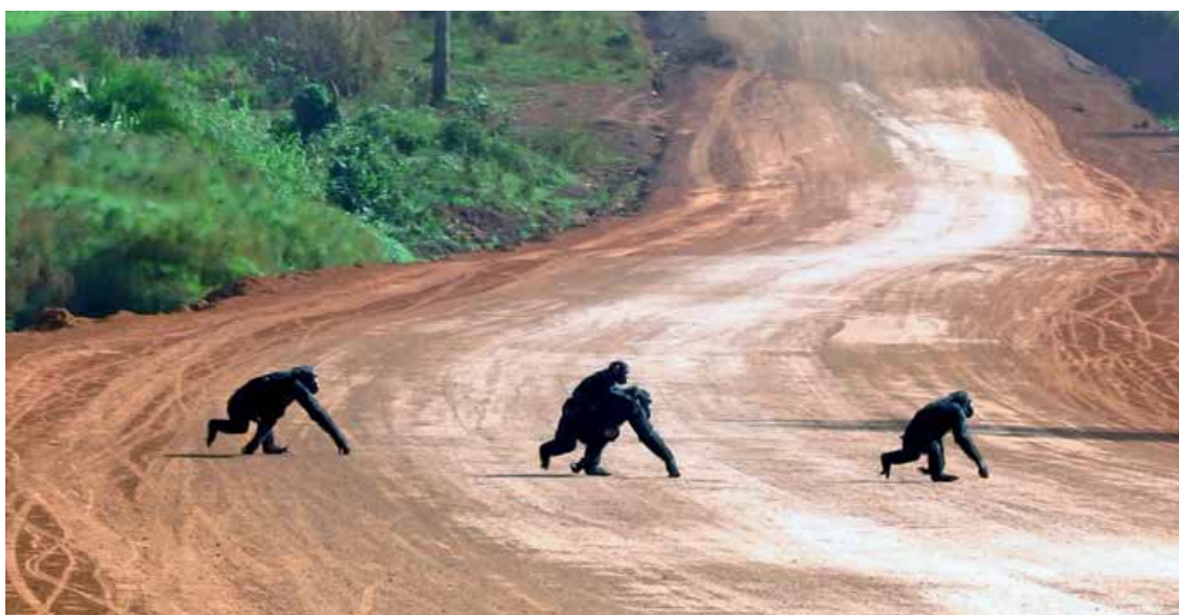
Many ape species are very reluctant to cross non-forested areas, such as roads. When they do, severe injuries and mortalities can occur from collisions with vehicles.

Before any decisions are taken about a landscape, a strategic environmental assessment (SEA) should be conducted that integrates the area's environmental and social values. It cannot be stressed enough that SEAs should be undertaken at the very earliest stages of planning